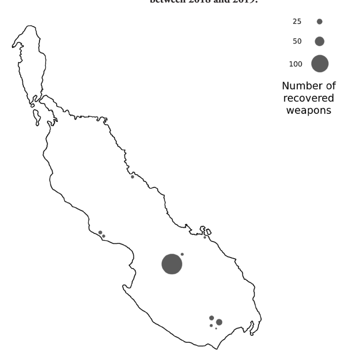
Figure 1. The geographical spread of disarmament in Bougainville between 2018 and 2019.

However, some evidence suggests that interim fighting persisted with original weapons, blurring phase separation (Forsyth, 2019, p. 9). Nonetheless, the second phase filled certain first phase gaps, revealing ongoing obstacles to definitive disarmament completion. The "latecomer" case exemplifies the challenges of defining completion timelines based on Bougainville's protracted experience with post-conflict weapons relinquishment.